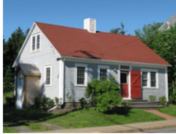
"Wattle & Daub"