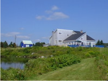
Quoddy's End Ocean Front Estate